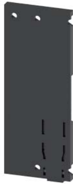
DIN-rail adapter accessory for: 3VA11 2P