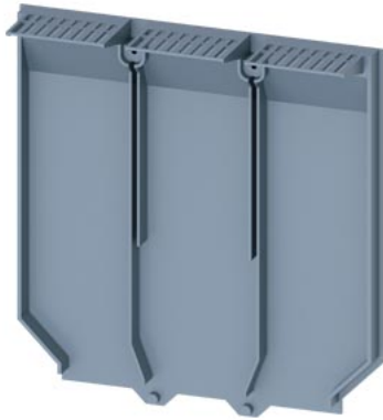
insulating plate broadened 3-pole; 1 unit accessory for: 3VA12