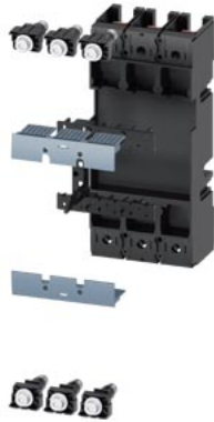
plug-in unit complete kit accessory for: circuit breaker, 3-pole 3VA12