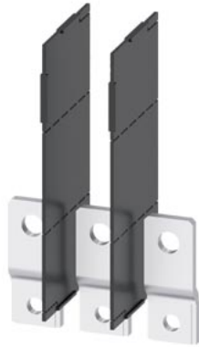
bus connector extended front mounted; 3 units accessory for: 3VA12