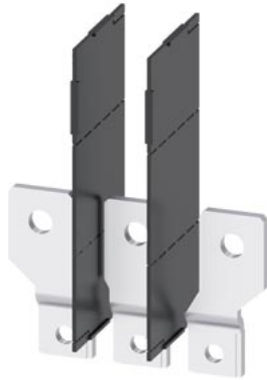
bus connectors broadened front mounted; 3 units accessory for: 3VA12