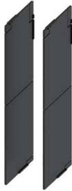
phase barriers; 2 units accessory for: 3VA20/21/22