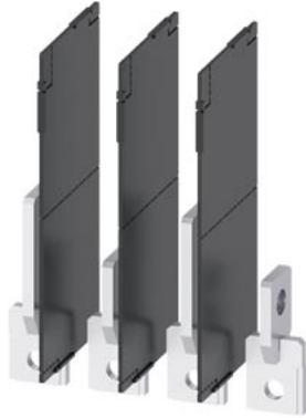
bus connector extended edgewise; 4 units accessory for: 3VA20/21/22