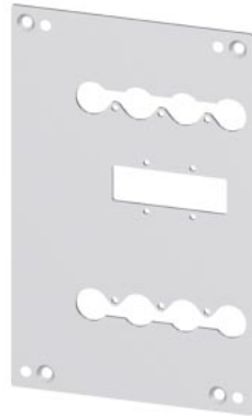
rear interlock mounting plate accessory for: 3VA20/21/22