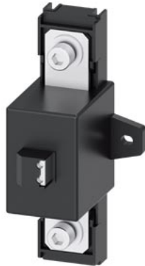
external current transformer for N conductor accessory for: 3VA2 In=400/500/630 A