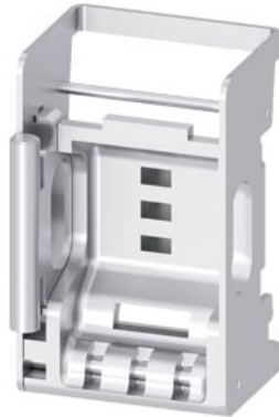
locking provision for handle accessory for: 3VA13/14 3VA20-24