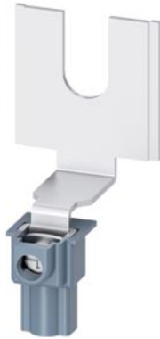
control wire tap for flat busbar connection accessory for: 3VA53/54; 3VA63/64