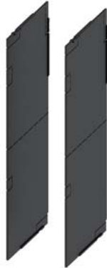
phase barriers; 2 units accessory for: 3VA13/14; 3VA23/24