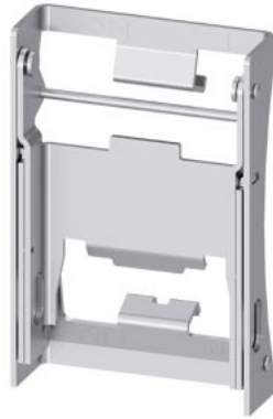
handle blocking device accessory for: 3VA55/65/66