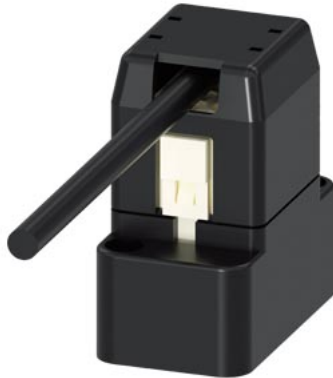
connecting cable for auxiliary circuits accessory for: plug-in unit 3VA9603-0KP00 3VA15/25