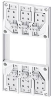
mounting base front connection accessories for: 3VA58/59, 3VA68/69