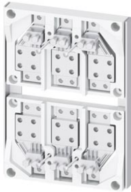
mounting base rear connection accessories for: 3VA58/59, 3VA68/69