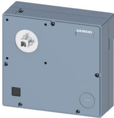
rotary operator with shaft stub for 8UC retrofit accessory for: 3VA57/58/59 3VA67/68/69