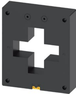
external current transformer for N conductor accessory for: 3VA6 In=1600/2000 A