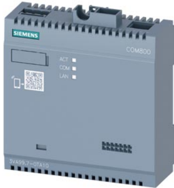
data concentrator COM800 accessory for: 3VA6