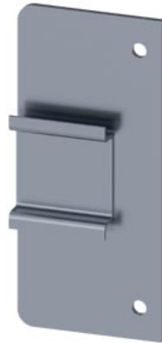
DIN rail extension for N/PE terminal