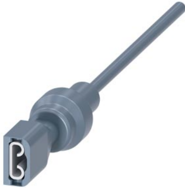
voltage tap accessory for: ETU 8-series