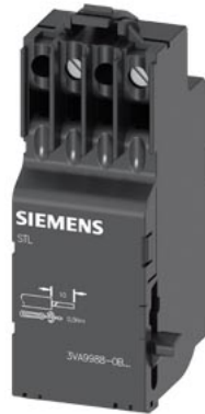
shunt trip left 12 V DC accessory for: 3VA1 and 3VA20-26