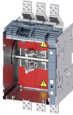
guide frame for 3VA27 - 3p front extended main connection accessory for circuit breaker 3VA27