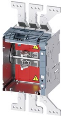
guide frame for 3VA27 - 3p front offset main connection accessory for circuit breaker 3VA27