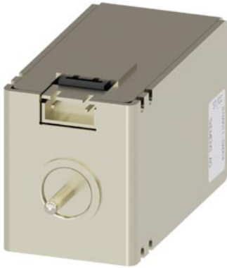
auxiliary solenoid 60 V AC/DC shunt release/closing coil (ST/CC) accessories for circuit breakers 3WL10 / 3VA27