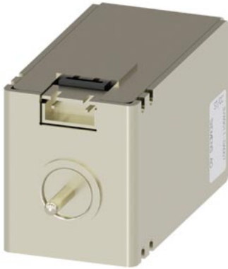
auxiliary solenoid 220...240 V AC/DC shunt release/closing coil (ST/CC) accessories for circuit breakers 3WL10 / 3VA27