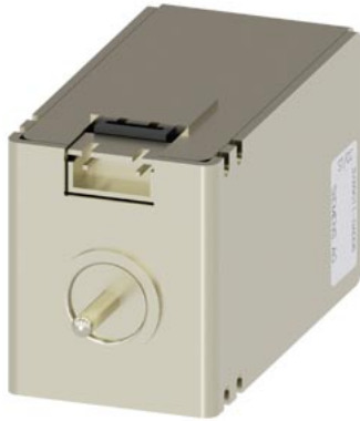
auxiliary solenoid 240...250 V AC/DC shunt release/closing coil (ST/CC) accessories for circuit breakers 3WL10 / 3VA27