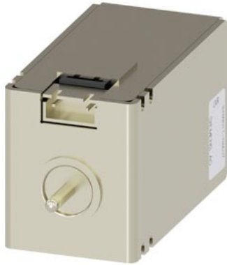
undervoltage release UVR 220...240 V AC/DC accessories for circuit breakers 3WL10 / 3VA27