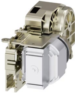
motorized operating mechanism MO 48...60 V AC/DC accessories for circuit breakers 3WL10 / 3VA27 (SE)