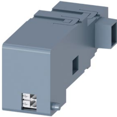
Modbus RTU Gateway COM042 communications module accessories for circuit breakers 3WL10 / 3VA27