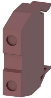
accessories for circuit breaker 3WA, auxiliary switch block (AUX) 2 NO+0 NC