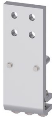
Accessory Circuit breaker 3WA, Front connection DIN 43676 double hole, top, 1 piece for frame size 2 - 2500 A for circuit breaker in fixed mounted design