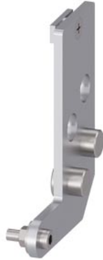
Accessory Circuit breaker 3WA, frame size 1 and 2, for 36 coding variants