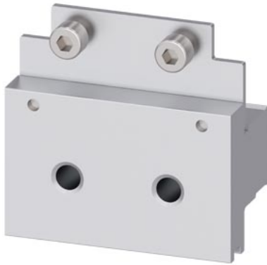
Accessory Circuit breaker 3WA, Flange main connection top or bottom, for frame size 2 - 3200 A for circuit breaker in withdrawable design, 1 piece