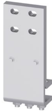
Front Connectors (top) for circuit breakers fixed mounted, Frame Size 2, for 3WA2 breaking capacity class S / H / E, In = 2500A, 1 piece (incl. hardware)