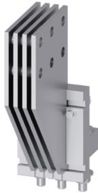
Front Connectors (top) for circuit breakers fixed mounted, Frame Size 2, for 3WA2 breaking capacity class S / H / E, In = 3000A, for 3WA3 breaking capacity class N / S / M / H / E, In = 2500A, 1 piece (incl. hardware)