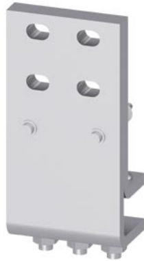
Front Connectors (bottom) for circuit breakers fixed mounted, Frame Size 2, for 3WA2 breaking capacity class S / H / E, In = 2500A, 1 piece (incl. hardware)