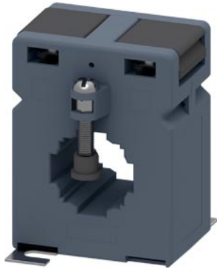
current transformer 300/5 A, 5 VA, Cl. 1.0