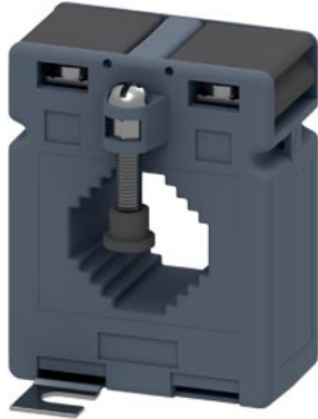
current transformer 800/5 A, 5 VA, Cl. 0.2 s