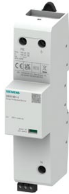
N PE lightning arrester, for 3+1 circuit, Uc 255 V, 1-pole with remote display