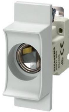
NEOZED, fuse base, D02, 1-pole, 63 A, Un AC: 400 V, Un DC: 250 V Schellenklemme incoming terminal: saddle terminal outgoing terminal: