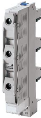
MINIZED, Switch disconnecter with Fuse, D02, 3-pole, In: 63 A, Un AC: 400 V, for Busbar system 8US 60 mm