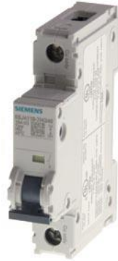
Miniature circuit breaker 240 V 14kA, 1-pole, D, 2A, D=70 mm according to UL 489, equal polarity