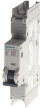
Miniature circuit breaker 240 V 10kA, 1-pole, D, 35 A, D=70 mm according to UL 489