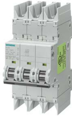
Circuit breaker 10kA, 3-pole, D, 30 A according to UL 489-480Y/277V