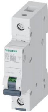
Miniature circuit breaker 230/400 V 6kA, 1-pole, C, 16A