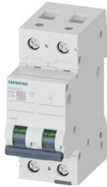
Miniature circuit breaker 400 V 6kA, 2-pole, C, 16A