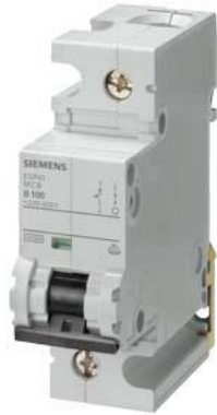
Miniature circuit breaker 230/400 V 10kA, 1-pole, B, 125 A, D=70 mm