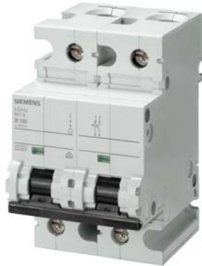
Miniature circuit breaker 400 V 10kA, 2-pole, B, 100 A, D=70 mm