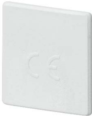
End cap 2 and 3-phase for pin busbars according to UL 508